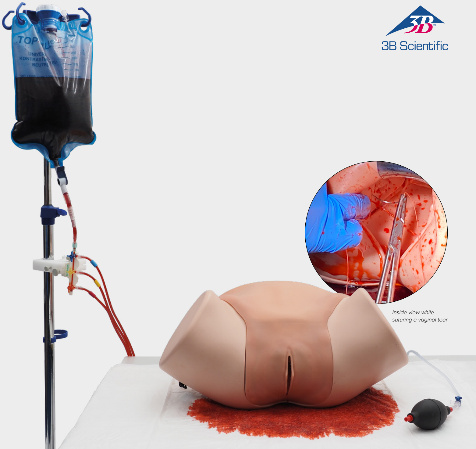
Inside view while suturing a vaginal tear