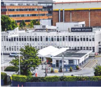
Elstree Film Studios

Founded in 2017, Lifecast Body Simulation has developed a range of highly accurate and lifelike medical manikins which are transforming the way medical simulation and education are delivered and absorbed.