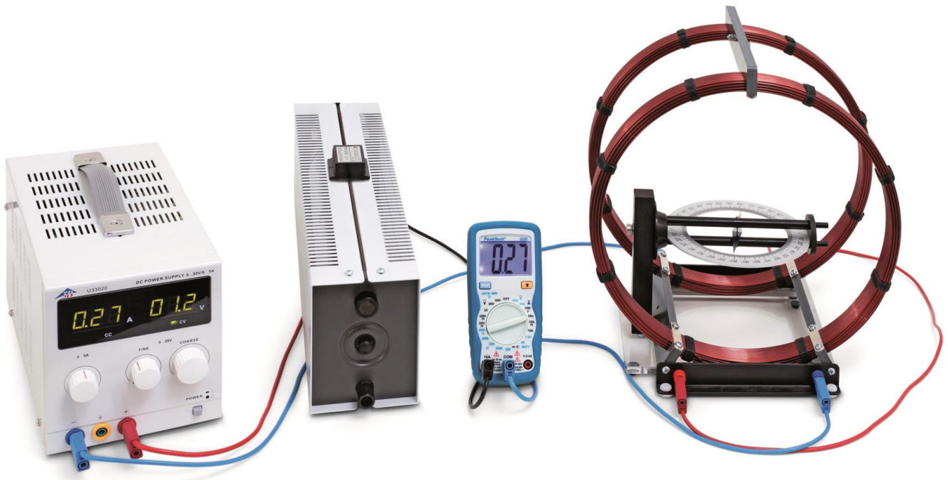
Fig. 1: Measurement set-up.